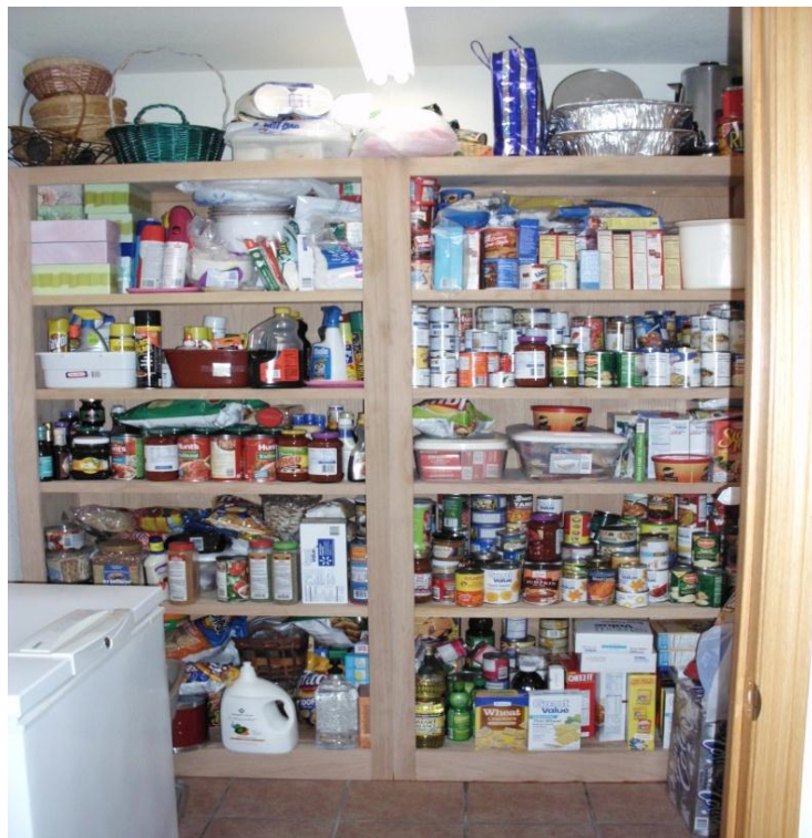
Walk-in Pantry with Built in Shelves and Freezer