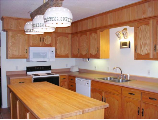
Other Views of Kitchen