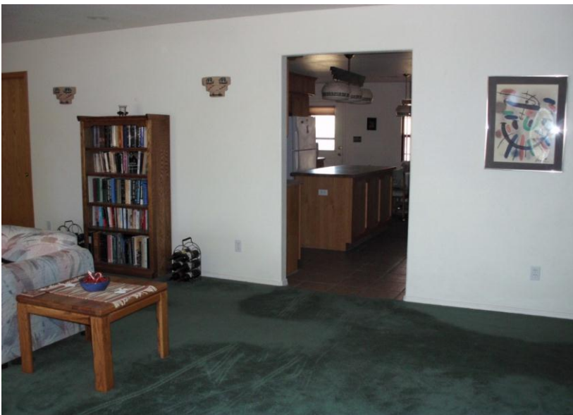
Living Room with Doorway into Kitchen