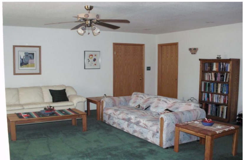
Door to Garage and Door to Half Bath from Living Room