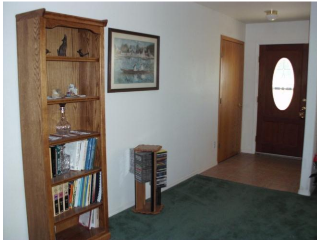
Front Entry into Living Room Showing Front Closet