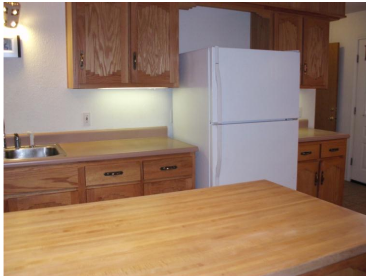
Butcher Block Center Island with Cabinets