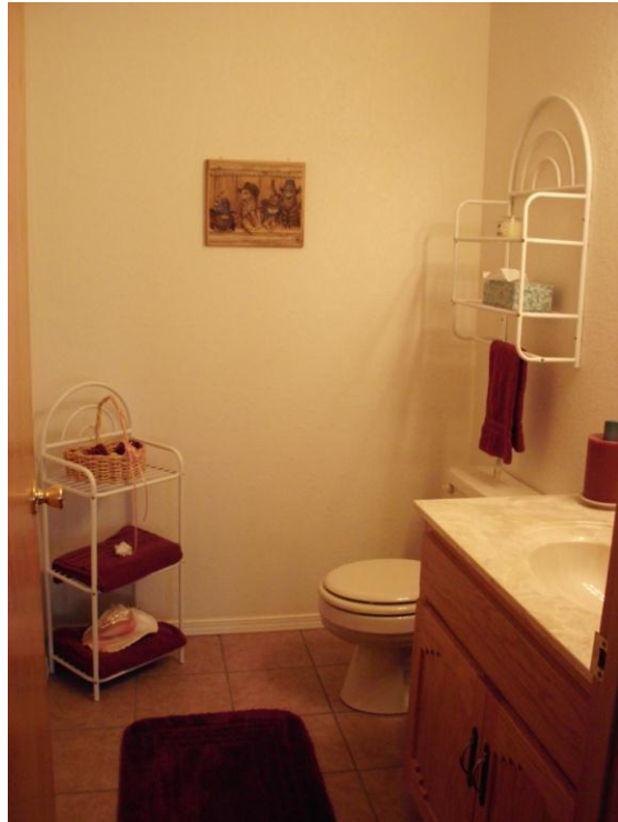
Half Bath off Living Room